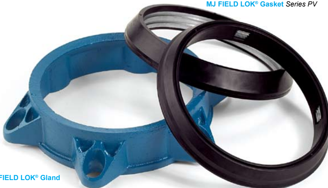
MJ FIELD LOK® Gland